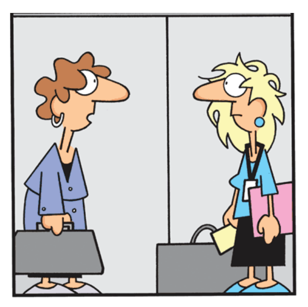
"How many times should I push the elevator buttons to equal the same calories as taking the stairs?"