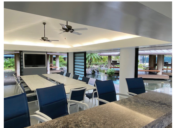
New countertop, tables, chairs and flat-screen TV

Walt also provided the idea for the faux wall that