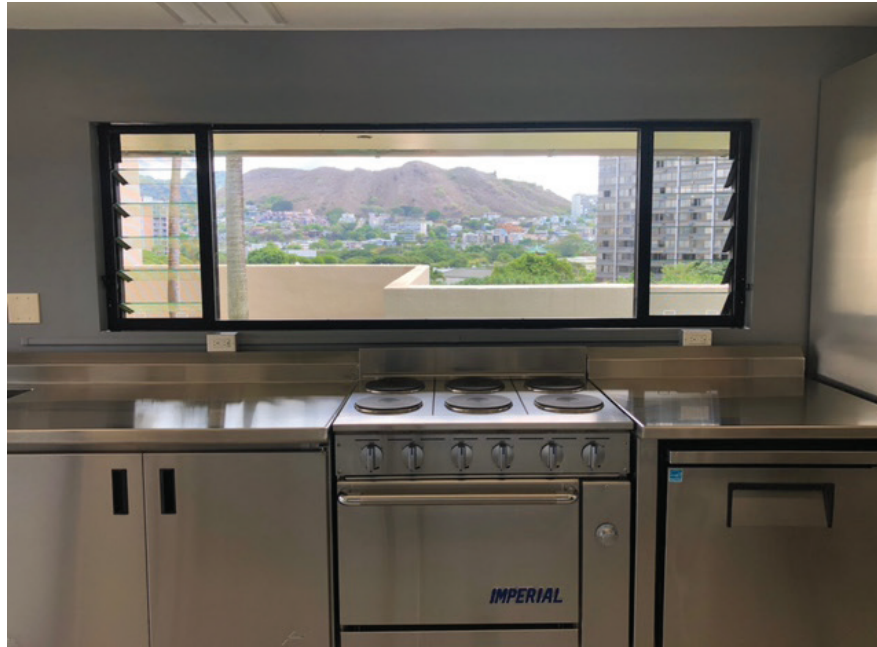
The new picture window with a view of Punchbowl

In the last newsletter, it was reported that the Long House was undergoing renovation and that it was expected to be completed in October. We're happy to report that it is now finished. The Long House has been transformed into a bright, open and airy space. A large window has been added in the kitchen that offers a perfectly framed view of Punchbowl. A counter with seating for four allows persons to take in that view while keeping an eye on what's happening in the kitchen. A new ice maker , electric six burner commercial grade stove and refrigerator replace appliances that had reached the end of their useful life.